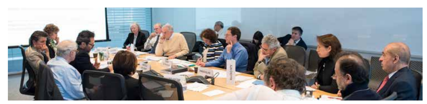
IEO workshop on the recently released evaluation of The IMF and Social Protection.

On July 31, 2017, there were fifteen staff positions (including the Director) at the IEO. Several staff members moved on and new ones were recruited during the period under consideration. The IEO maintains a diverse group of professionals, of whom more than half come from outside the Fund. In addition, the IEO continues to rely extensively on external consultants to bring expertise and fresh perspectives to its evaluation work.