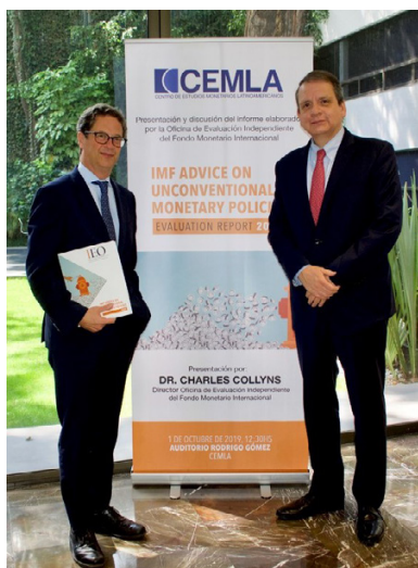
IEO presentation of IEO evaluation of IMF Advice on Unconventional Monetary Policies at CEMLA, Mexico City, Mexico, September 2019.