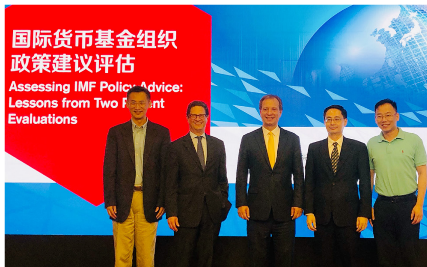
IEO presentation on Assessing IMF Policy Advice: Lessons from Two Recent Evaluations at Tsinghua PBCSF, Beijing, China, July 2019.