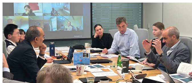
IEO EAP mid-term workshop, April 2024.