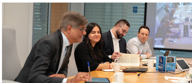
IEO IMF Mandate exit workshop, March 2024.

of its design and implementation since 2002, with special attention to most recent exceptional access cases.