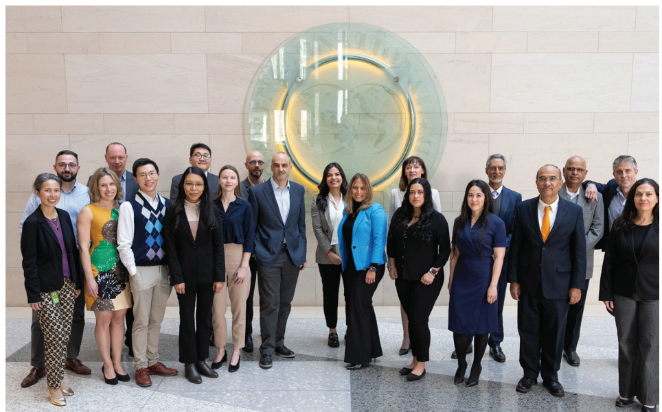
IEO group photo, March 2024.

The Independent Evaluation Office (IEO) was established in 2001 to conduct independent and objective evaluations of IMF policies and activities. Under its Terms of Reference, the IEO is fully independent from the management of the IMF and operates at arm's length from the Executive Board. The IEO's mission is to enhance the learning culture within the Fund, strengthen the IMF's external credibility, and support the Executive Board's institutional governance and oversight responsibilities.